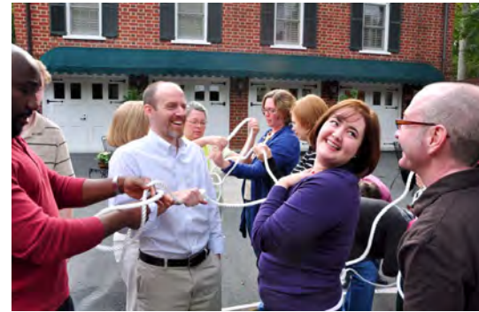
A team-building exercise during a retreat at the President's Garage