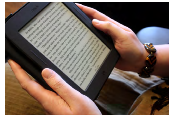
E-book readers are available for loan.