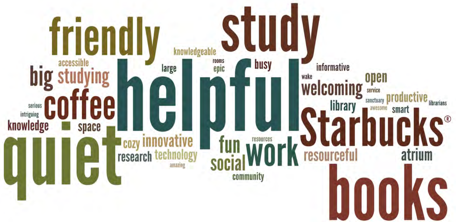
Word Cloud from 'ZSR in Five Words' project Fall 2010