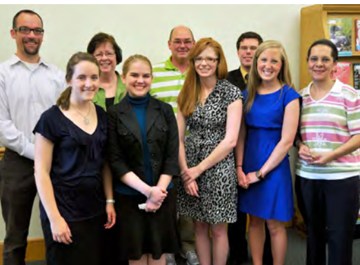
Senior Showcase honorees and their faculty advisors