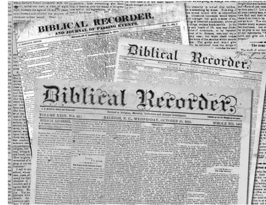
Issues of the Biblical Recorder , now available digitally

"I was at a loss over how I would teach 21 students the basic technical skills they need, that is, until I met your staff. They made sure that my students have the equipment they need for their field work." - WFU faculty