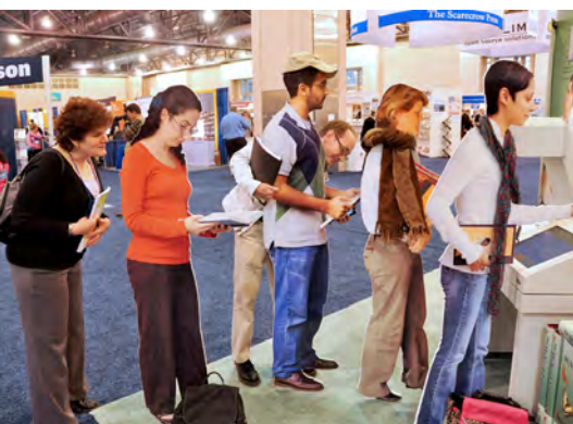
Library faculty attended the ACRL National Conference in Philadelphia

"ILL is the greatest service that the ZSR offers, and I really appreciate all the help your office has given me over the last three years."