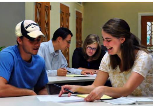
Students and tutors working in the new Writing Center