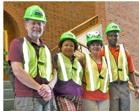
ZSR faculty and staff completed CERT (Community Emergency Response Training) in May, 2011. This group will be able to respond to campus emergencies.