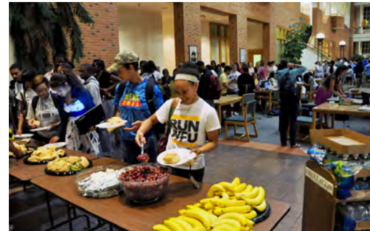
"Wake the Library" midnight food line

"I was so lost with my research for my lab report, and the librarian was extremely helpful and efficient. I was in and out quickly with everything I needed." -Wake Forest student