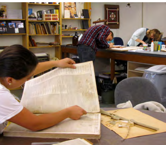
Student assistants at work in the Preservation Department

“There were only two sources, two libraries worldwide, that had the information I was seeking... One library is the National Library of Australia, and the other, Z. Smith Reynolds Library.”