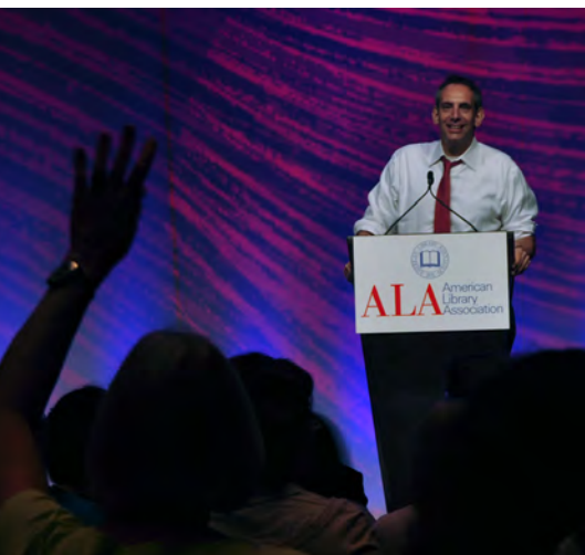
StoryCorps founder Dave Isay speaks at an American Library Association Conference

Innovative Demand-Driven E-book Acquisition Program: The library launched an exciting e-book project by adding over 40,000 e-books to the catalog in a single stroke. By comparison, ZSR bought about 17,000 print books in all of fiscal year 2010. Even more e-books will arrive regularly. Users can read these recent, academic imprints with almost any device that includes an Internet browser: desktop computer, laptop, tablet and some types of smartphones and e-readers. With this program, the library only pays for what is used. The library pays a small rental fee for the first five uses of an e-book. Higher-use books are purchased for permanent addition to the library collection. The library covers all costs, and readers typically cannot distinguish between rental and purchased e-books. Overall, this arrangement allows the library to make many more books available while keeping within budget.