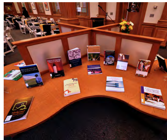
Faculty publications on display