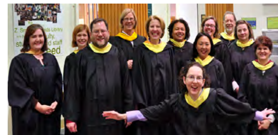
Library faculty participated in the Founders' Day Convocation