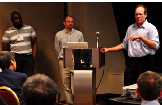
ZSR presentation on cloud computing at the LITA National Forum in Atlanta

"When I come in, whether in search of a scholarly article or for the latest installment of Mad Men , I always feel welcomed by our warm & engaging staff."