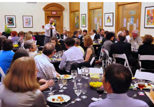
ZSR Library hosts the annual Faculty Author Dinner.