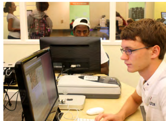
Students in the Digital Media Lab, adjacent to The Bridge

StoryCorps Digitization Project: StoryCorps provides "Americans of all backgrounds and beliefs with the opportunity to record, share, and preserve the stories of our lives." Since 2003, over 70,000 participants have recorded more than 35,000 interviews. StoryCorps came to Winston-Salem in 2009, and 120 of the resulting interviews are included in a local collection that was digitized this year. Streaming audio files of the interviews are accompanied by transcripts and images of the participants. The collection is available from any computer on the Wake Forest network at http://zsr.wfu.edu/collections/digital .