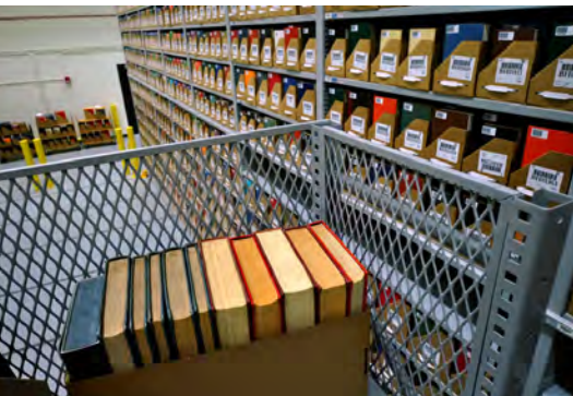
The new storage facility has 40' tall high density shelving.