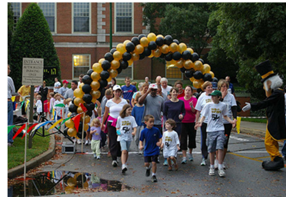
All ages enjoy the start of the Wake the Library one mile Fun Run.