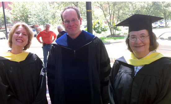
Library faculty at a Convocation.

“Every encounter I’ve had with your staff has been amazingly positive. You have some of the most helpful, professional, knowledgeable, and friendly folks working for you.” - WFU Staff member