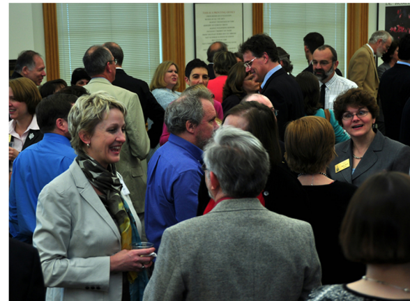
In March 2010, a faculty author reception was held in the library's Mandelbaum Reading Room.