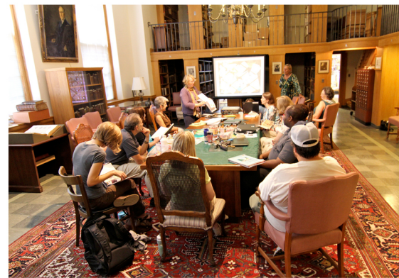
Art professors from the University of Portsmouth, UK discuss art journaling in the Rare Books Reading Room.