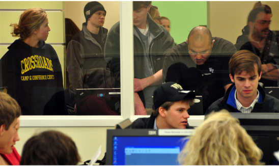
The Bridge and multimedia lab see heavy use from students during the semester.